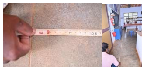
Biology lab breadth - 6m2cm (6m)