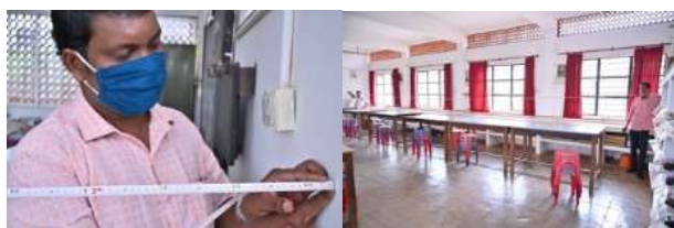
Chemistry lab length - 12m30cm