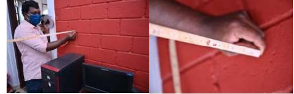
Library breadth - 6m8cm (6m)