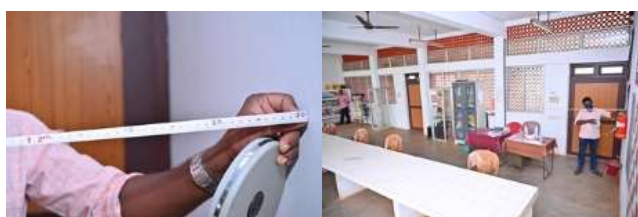
Computer lab length - 14m9cm (14m)