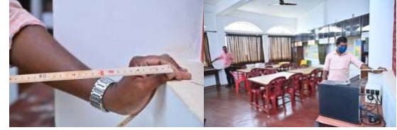
Language lab breadth - 6m11cm (6m)