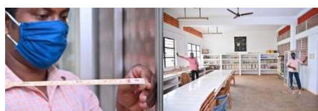
Computer lab breadth - 6m2cm (6m)