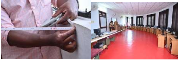
Mathematics lab length - 8m10cm (8m)