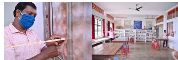
Chemistry lab breadth - 6m2cm (6m)