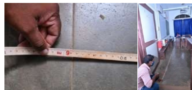
Physics lab breadth - 6m1cm (6m)