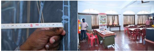
Language lab length - 6m12cm (6m)