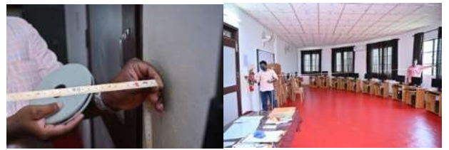
Mathematics lab breadth - 6m9cm (6m)