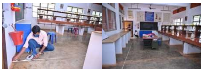
Biology lab length - 12m30cm