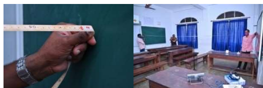
Physics lab length - 12m33cm (12m30cm)